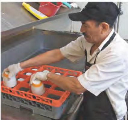
Load cups and glasses rim down.