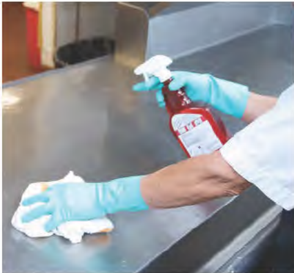
When using workplace chemicals, follow all hotel procedures, and wear gloves & eyegear.