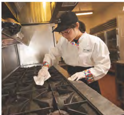
Use a folded cloth to thoroughly wipe all surfaces. Never clean a stove top while burners are on.