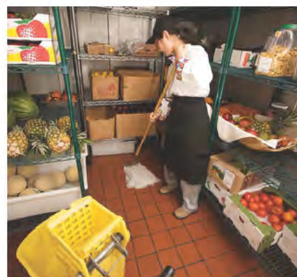
Once it is swept, wet mop, then immediately dry mop, one small area of the floor at a time.