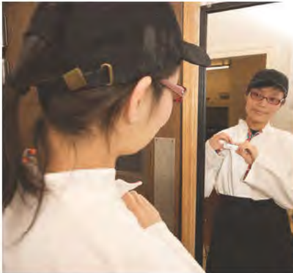
Before beginning your shift, make certain your grooming and attire meet your hotel's standards.