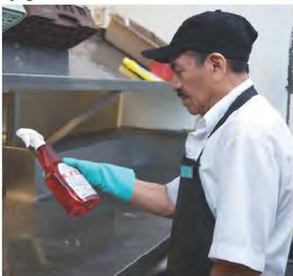
Read the chemical label every time before you use it.