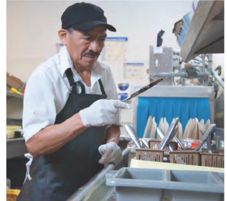
Always use gloves when handling freshly-washed tableware.