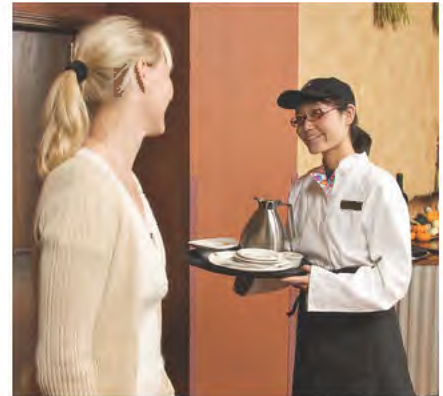
Whenever you are working in public view, smile and look for any way to assist a guest.