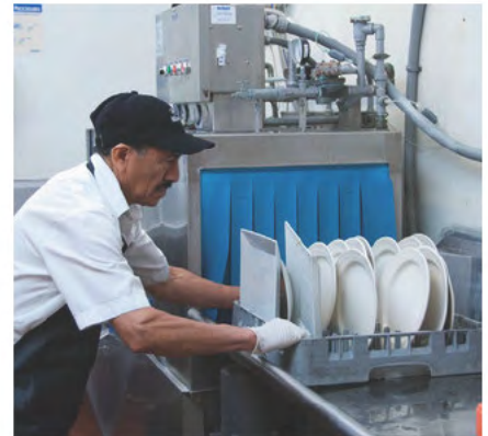
When unloading dish racks, move them to the furthest end of the table.