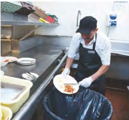
Wearing rubber gloves, scrape all food scraps into a receptacle or garbage disposal.