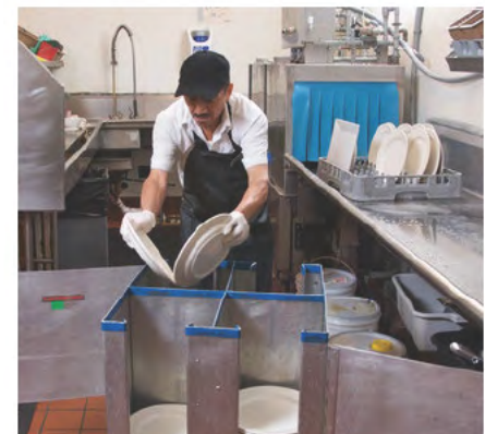
Stack washed china in a clean "poker chip" dolly.