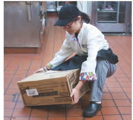
Before you attempt to lift an object, determine if it's possible for you to lift it alone.