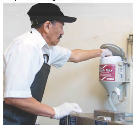
Check the detergent dispenser and refill it as instructed by your Supervisor.