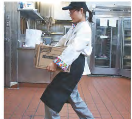
Lift with your legs. Keep your back straight and grip the object with your whole hands.