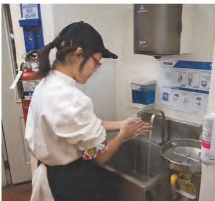
Wash your hands regularly with soap and hot water.