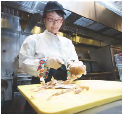
You may also be asked to help prepare food as instructed by the Cook.