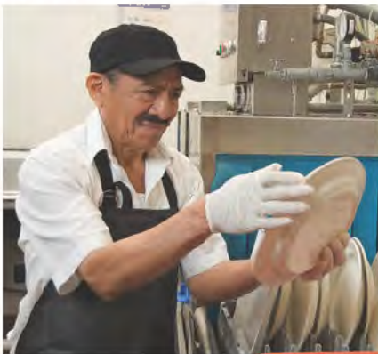
One of your most important responsibilities is to make sure all tableware items are clean and ready.