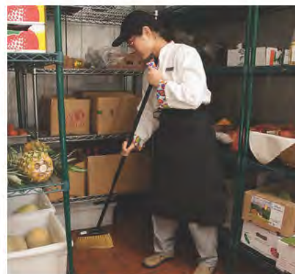
Begin cleaning the walk-in refrigerator by sweeping it.