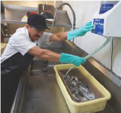
Prepare silverware for the dishwasher by letting it soak in a pre-wash soaking solution.