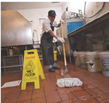
If you see a spill or a leak, clean it up immediately to avoid slips and falls.