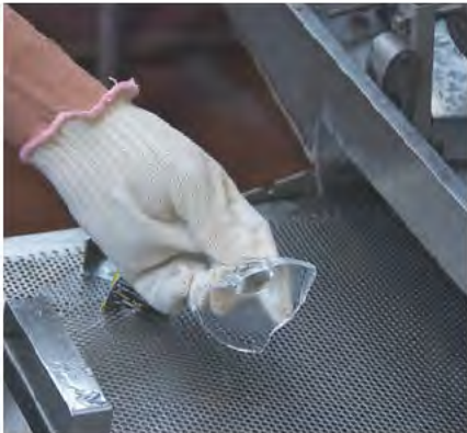
Always use gloves and extra care when handling broken items.