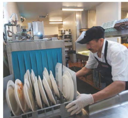
The most important piece of equipment that you will use is the dishwashing machine.